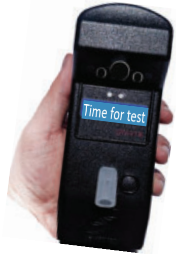
Supervising officers and program participants are both set for success.

Advanced yet intuitive design makes compliance management a snap.