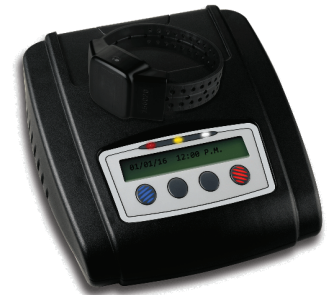
Home Monitoring Unit