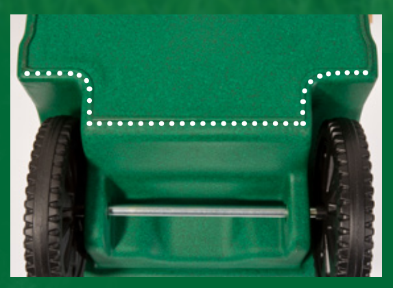
Toter carts feature a heavy-duty wear strip to withstand dragging across rough surfaces.

There's no other curbside collection cart that's built to last quite like a Toter. Constructed using Toter's Advanced Rotational Molding™ process, Toter carts are built to keep working long after others fail - more than 2x longer. They're backed by a 12-year body warranty, the best in the industry. Toter carts are extremely flexible, impact-resistant, and easily handle the day-to-day abuse of curbside waste collection.