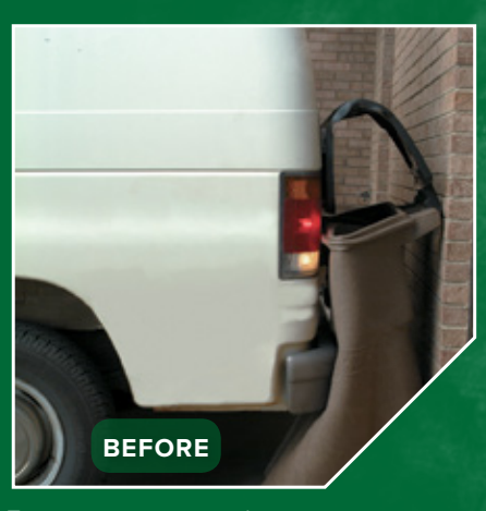
Toter carts are extremely impact-resistant – they flex, but don't break.