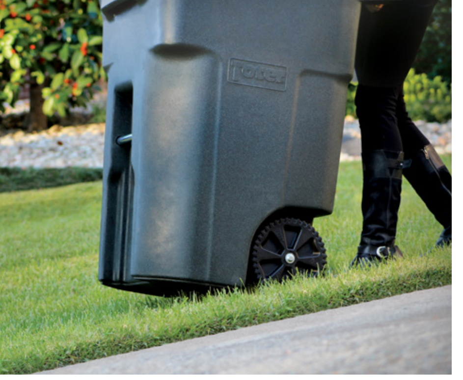
Toter carts are easy to tilt and roll to the curb.