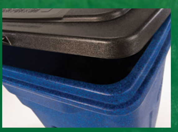
Only Toter carts have a Rugged Rim® to extend the life of the cart.