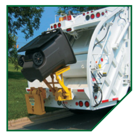
Toter carts are compatible with both fully automated arms (left) and semi-automated lifters (right).