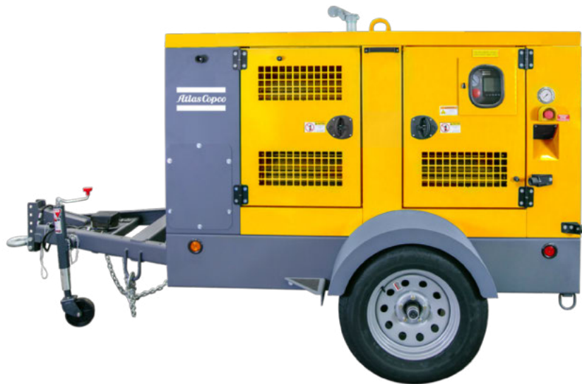
Indicative picture of the product

Authorized Distributor: Holland Pump Company 7312 Westport Place, WPB, FL 33413 (561)697-3333 sales@hollandpump.com