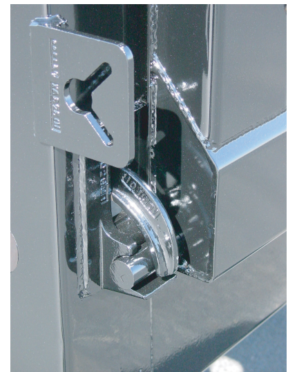
Lower tailgate latch is 4140 grade cast steel. Latch pivots are bushing type width 1 1/4" diameter pin for extra support.