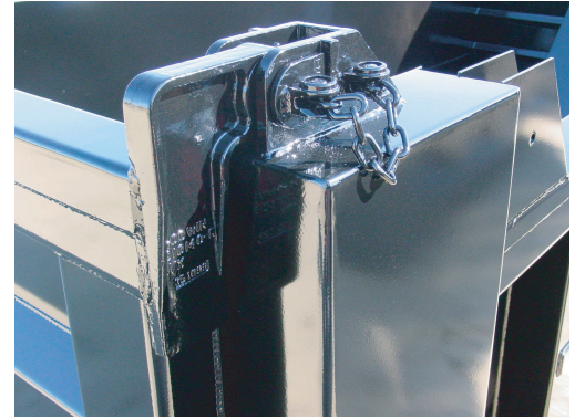
Tailgate hardware is cast steel with grease fittings.

Air tailgate latch, 36" cab shield, 8 gauge sides, 3/16" one piece floor, 6 panel tailgate, Center coal door, Grip strut walkrod, Horizontal bracing, Asphalt chute, Front corner posts