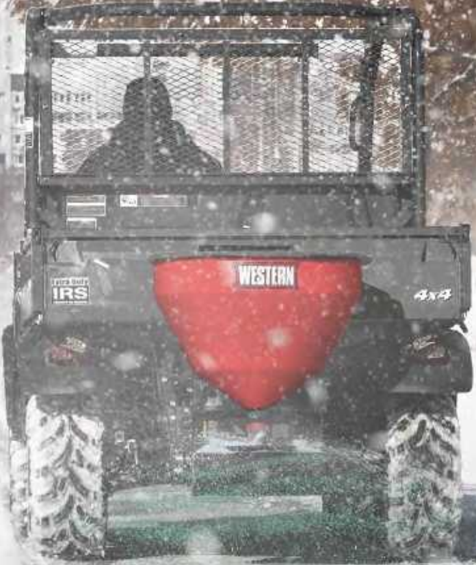
Shown with optional cover accessory.

This 3.0 cu ft poly hopper comes standard with a 2" receiver mount. Additional mounts available include a utility mount, drop utility mount, trailer mount and a 3-point mount.