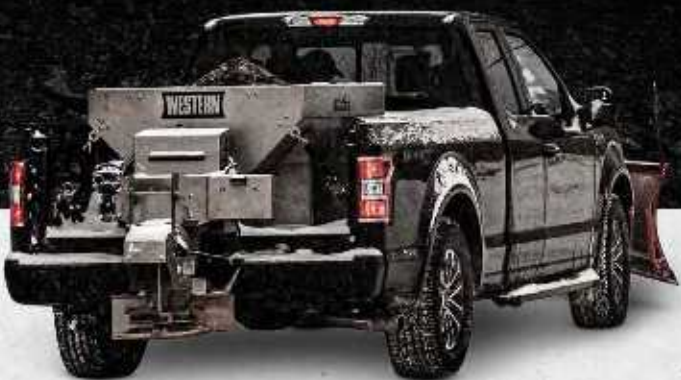
Photo may be shown with optional accessories.