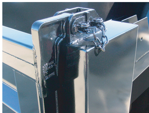
Tailgate hardware is offset cast steel with zerk grease fittings.