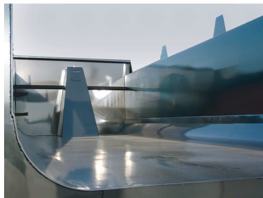
Shown is the inside of the 600U/T body and 12" floor to side radius.