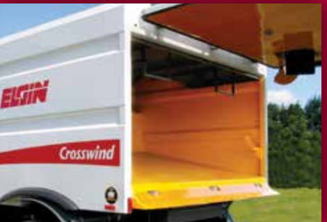
LIFELINER<sup>®</sup> HOPPER SYSTEM The LifeLiner hopper liner and finish system greatly improves the life, durability, and dumping functionality of a sweeper hopper. It is backed by a lifetime warranty*

The versatile, hydraulic-assist hose gets into hard to reach places and is effective in catch basin cleaning. It handles multiple tubes for especially deep catch basin cleaning.