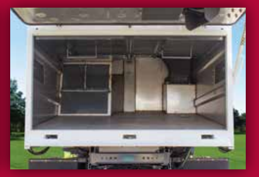
STAINLESS STEEL HOPPER SYSTEM This complete hopper body is constructed entirely of 304 grade stainless steel to provide maximum service life, even in the most corrosive applications. It is backed by a lifetime warranty*.