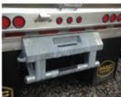
Rear push bumper with tow hooks