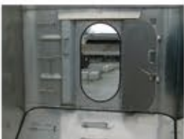
MAC Man Door