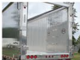
Air Flow Gate