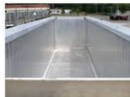
Low Bow Top Rail