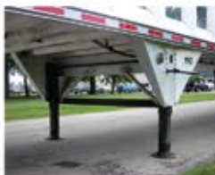
Save weight with reverse mount dollies