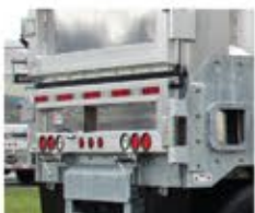
Packer latch with split door feature