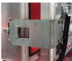
Galvanized Paddle latch