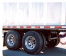
Sliding air ride suspension