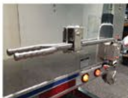
Mechanical side latch