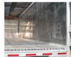
Full interior sidewall liner option