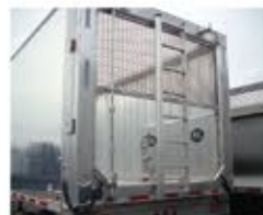
Split air flow gate - Solid/mesh combo