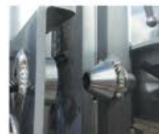
Door in door - cone and bushing