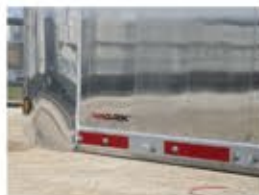
"MVP" MACLOCK Smooth Side Panel