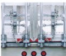
Quad cam locks