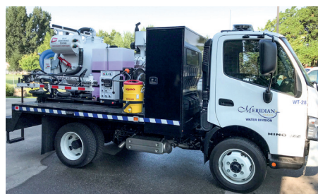
Both Standard LX and Grand LX Skids fit on standard utility flatbed vehicles.