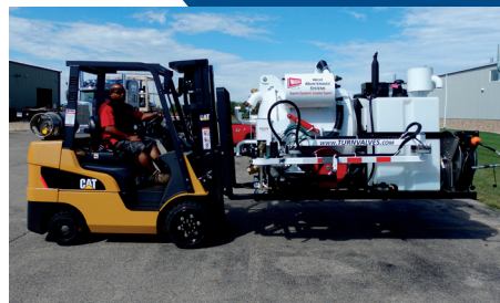
8in fork slot tubes run the full length of the heavy-duty steel frame

* E.H. Wachs does not make truck recommendations. E.H. Wachs will provide size, weight, mounting information and other technical information to support modifiers/upfitters deliver you a quality valve maintenance vehicle.