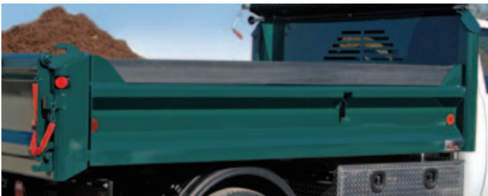
Solid Poly Sideboards for Board Pockets