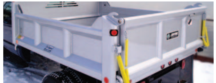
Vertical side and tailgate braces