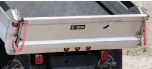
Quick-Drop Tailgate provides a single point of access.