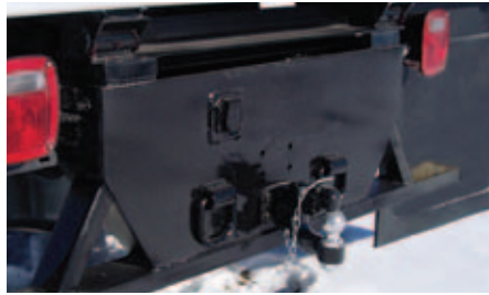
Pintle and Receiver Hitch Plates