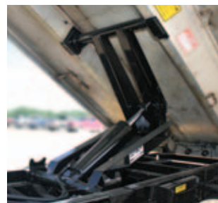
Lo-Boy Hoists – Engineered for easy installation, ease of operation, safety and long service life, the Lo-Boy is designed with a far-forward lift point, providing easier load elevation and greater stability.