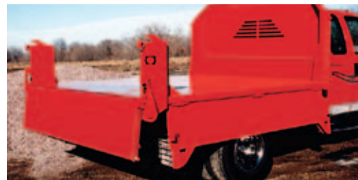
Fold-down sides feature an over center design for smooth operation