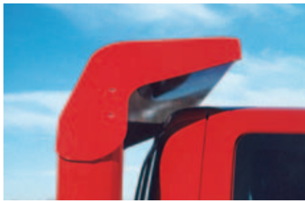
1/2, 3/4 and full cabshields, tapered or straight