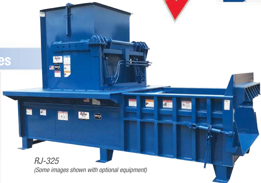
RJ-325 (Some images shown with optional equipment)

The iSmart trademark is the property of iSmart Technology Inc.