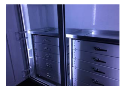
LED STRIP LIGHTING

LED lighting illuminates entire area of compartments giving user maximum visibility.2