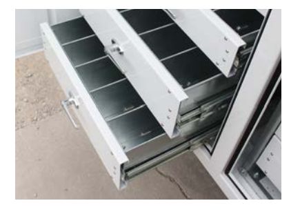
DRAWER UNITS Heavy-duty drawers built on 500lb. slides with individually locking handles.