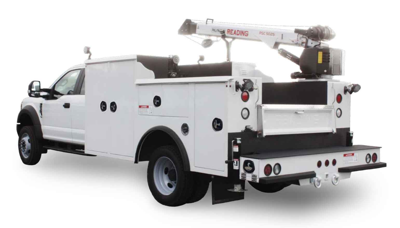
** Unit shown with optional equipment