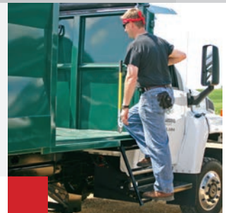
Swing-out door with convenient stow-away ladder offers quick and easy accessibility.