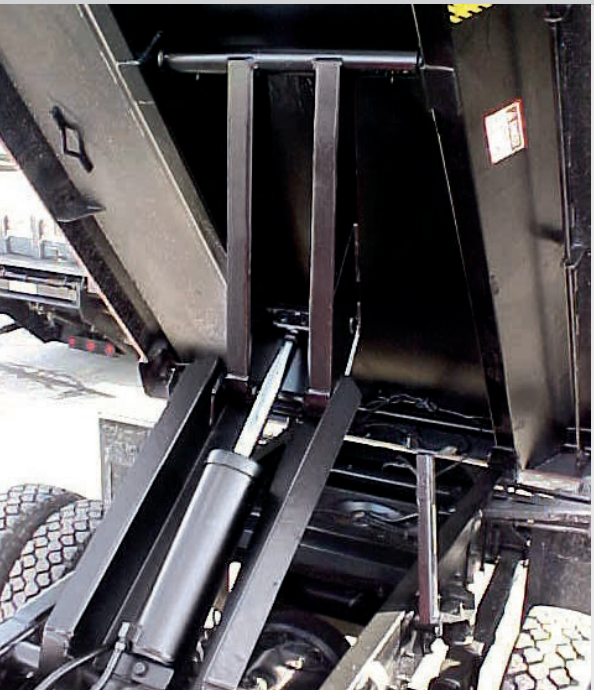
Crysteel Lo-Boy hoists are made in the USA and rated by the NTEA.