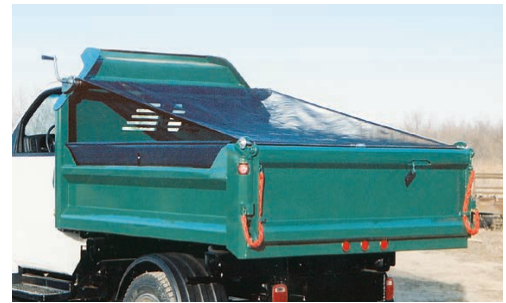
Fully integrated load cover option exemplifies convenience.