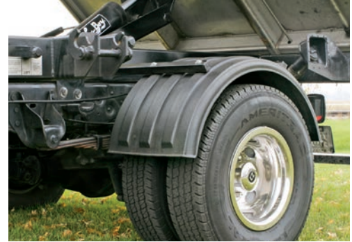
Poly Fenders are available in 16" and 22" Single Axle Fender Kits.