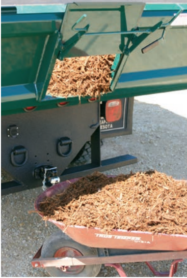
Sliding center patchgate controls material flow.