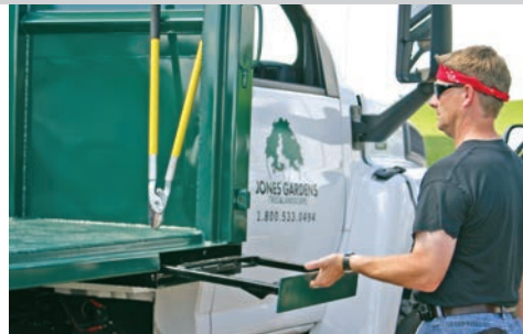
Upper tailgate swings completely away and latches securely in place when needed.