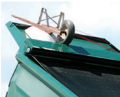
Full weld-on Cabshield with accommodations for tarp.

Cabshield deck is 40" to allow wheelbarrow storage with tie down hooks.