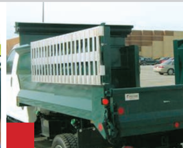
Optional sliding center patchgate controls material flow.