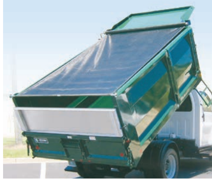
Standard Manual Tarp or Spring Tension Tarp.