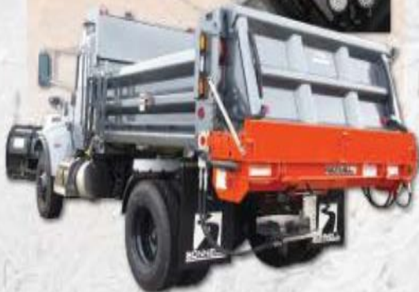
TRUCK PICTURED ABOVE SHOWN WITH ADDITIONAL OPTIONS