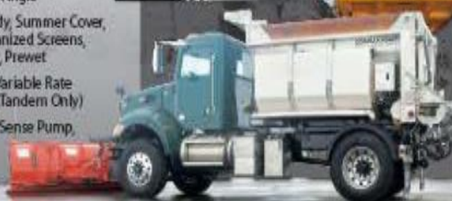
TRUCK PICTURED ABOVE SHOWN WITH ADDITIONAL OPTIONS