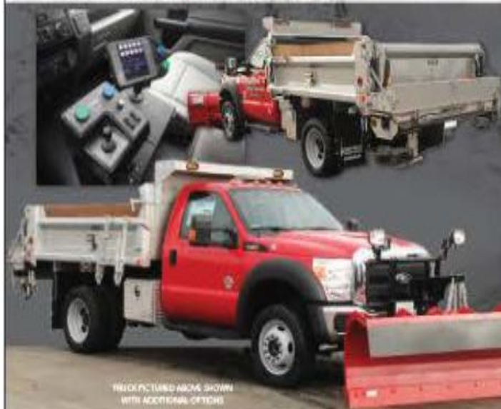
TRUCK PICTURED ABOVE SHOWN WITH ADDITIONAL OPTIONS