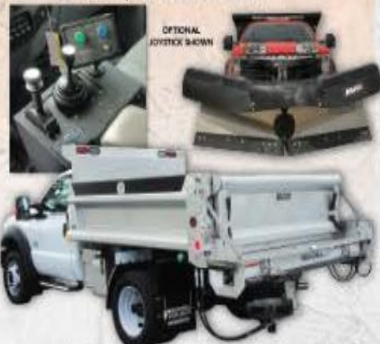
TRUCKS PICTURED ABOVE SHOWN WITH ADDITIONAL OPTIONS