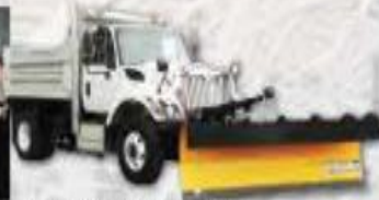
TRUCK PICTURED ABOVE SHOWN WITH ADDITIONAL OPTIONS