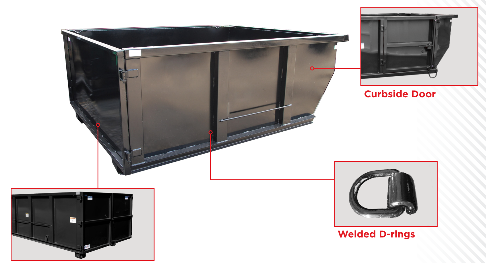
Single swing or barn doors