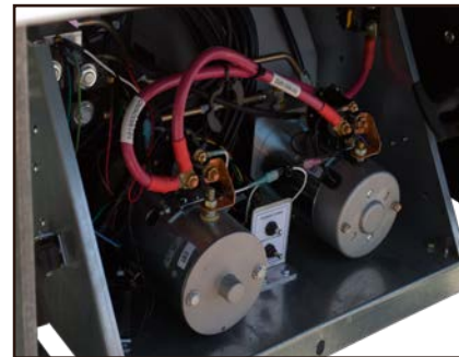
Dual Pump and Motor on 5,500 lb. and 6,600 lb. models with simple toggle to backup. STD Feature.

Platform Warning Lights are standard on all WDV GEN II models to provide added safety and security. The lights automatically flash when the liftgate is in operation.