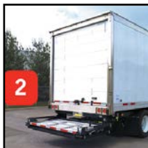
2 Powers Out from Under Trailer