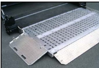
Optional Side Access Ramp