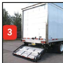
3 Manually Unfold Aluminum Extension