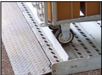
Optional Cart Stop