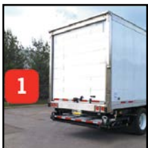
1 Stores Completely Underneath Trailer

Mounting the GT requires only 64 1/2" behind the rear axle