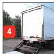
4 Liftgate Positioned for Cargo Loading