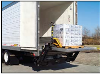
Stores completely underneath the trailer