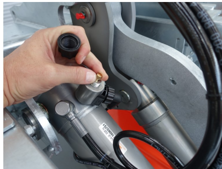
Self-lock valves with manual override