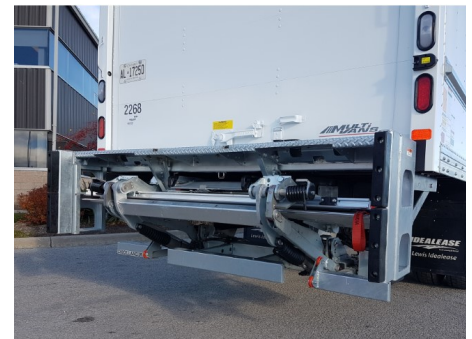
Walk-ramp kit (optional)