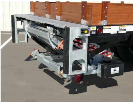
Heavy duty bed extension & side steps