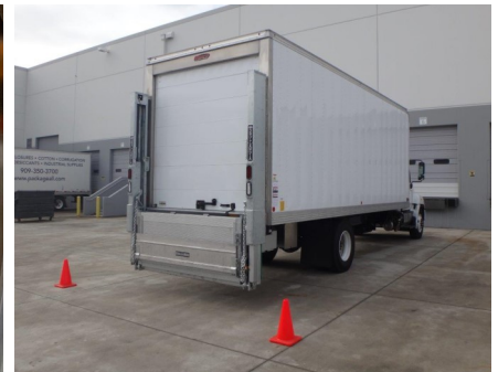
Galvanized finish STANDARD