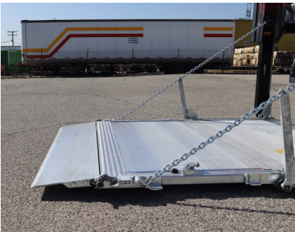
Aluminum retention ramp