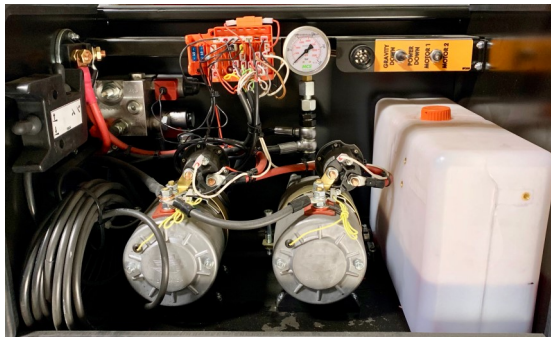
Dual pump & motor (optional)