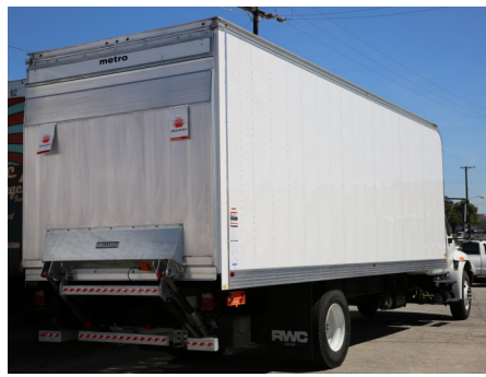
Optional flip-up door kits