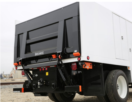
Heavy duty steel platforms available