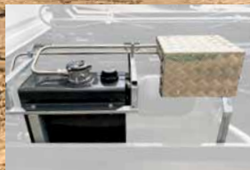
Tank + Valve