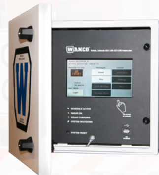
In-Cabinet Controller (location shown below)