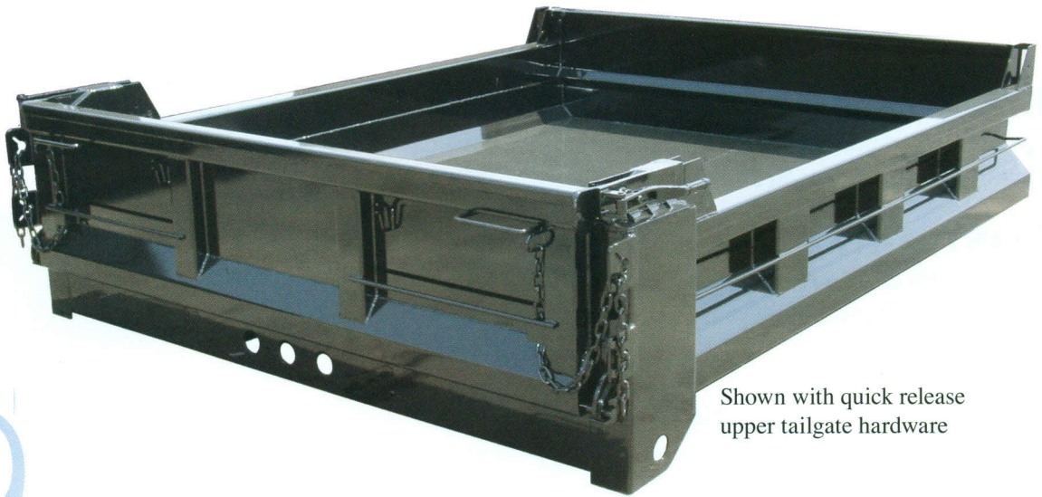
Shown with quick release upper tailgate hardware