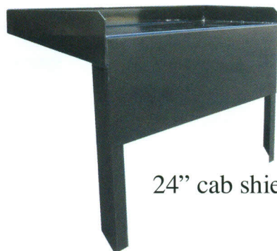
24" cab shield

All Godwin bodies are constructed of 10 gauge ASTM-A 607 grade 50 material or equal. To help our bodies maintain their durability and long life they are powder coat primed black standard. A 24" cab shield is also standard equipment on the 184U.