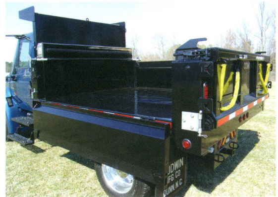
Optional drop sides in the down position. The side easily unlatches with a single handle and folds down lower than the body floor. Body shown with additional options.