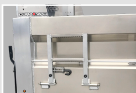
Fold-Up 2 Step Ladder