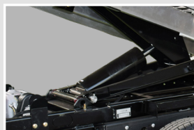
Champion Hoists Manufactured in USA