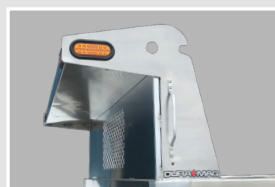
Strobes (Shown on Standard Cab Shield with Optional Grab Handle)