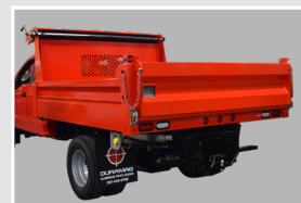
Powder Coating Color Options