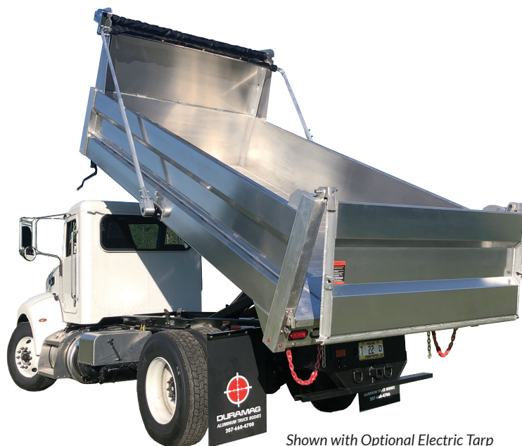
Shown with Optional Electric Tarp