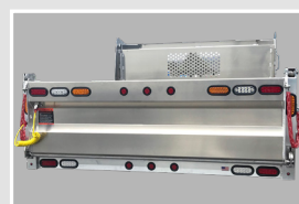
Rear Light Bar (Compatible with Under Tailgate Sand Spreader)

Visit our website at DuraMagBodies.com for additional options »