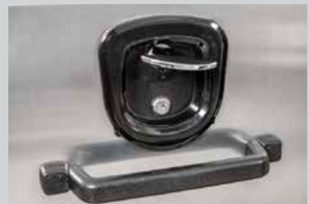
Locking die cast compression handle keeps tools safe and secure