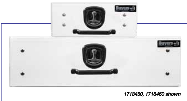
1718450, 1718460 shown