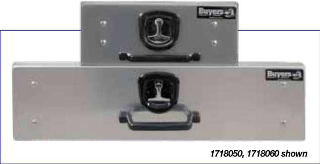
1718050, 1718060 shown