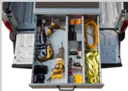
Removable partitions and optional dividers (sold separately) can be positioned to accommodate your storage needs