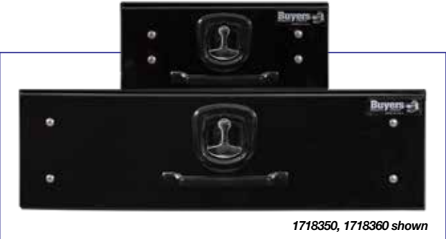
1718350, 1718360 shown