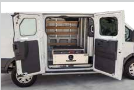
Installs in the bed of your truck or in cargo van for easy slide-out access to tools