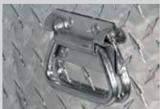
Two zinc-plated handles for easy lifting.