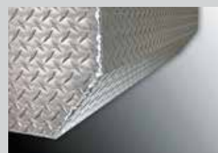
Angled body design is ideal for use with fifth wheel and goose-neck trailer applications.