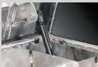
Gas shock cover support protects shocks from damage.