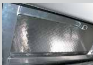
Reinforced lid for extra durability.