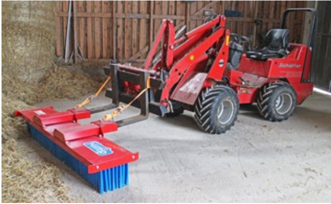
The SweepAway™ can handle a variety of materials, such as leaves, sand, rocks, debris, snow, slush etc.