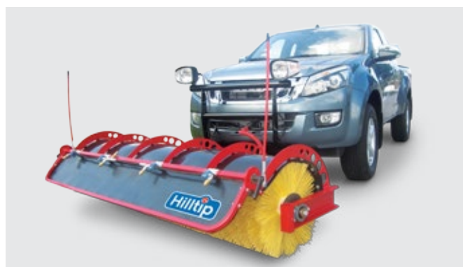
SweepAway™ rotary broom on pickup