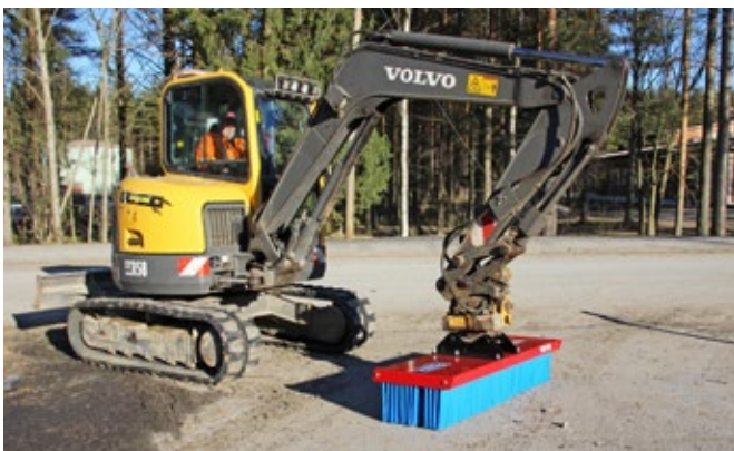
SweepAway™ on excavator