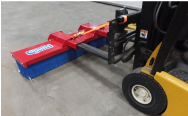
SweepAway™ with attachment for forklift