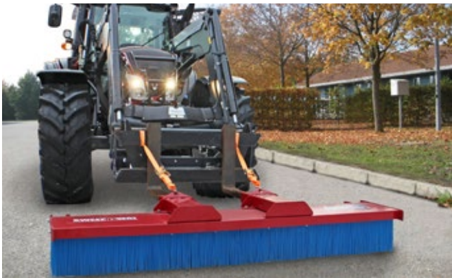
SweepAway™ medium series, with 12 brush rows