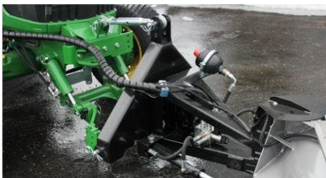
3 point hitch for tractors.