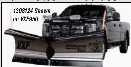
1308124 Shown on VXF95II