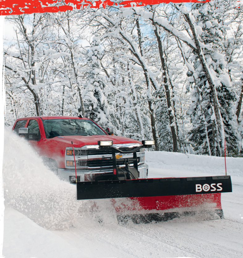
8' Steel Super-Duty

Super-Duty Steel 7'6", 8', 8'6", 9' Super-Duty Poly 7'6", 8'