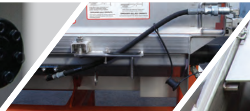
Safety interlock disables auger when opening bottom door or top cover