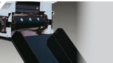
The included quick detach 24" extension plate can be used on either side of conveyor