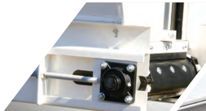
Heavy duty sprocket and shaft allows consistent material flow