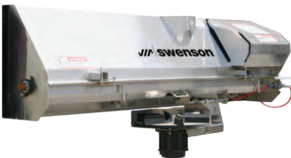
Replaceable Tailgate R-Series™

Matching your performance needs to your application needs is critical to selecting the right Swenson Tailgate Spreader. With a complete line of rugged equipment to choose from, it is easier than ever to make the right choice. We pride ourselves on our innovative product offerings and understanding how to match the right equipment with the proper material to give you solutions that meet your needs.