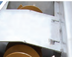
Anti-flow plate prevents material free flow and helps minimize material waste.