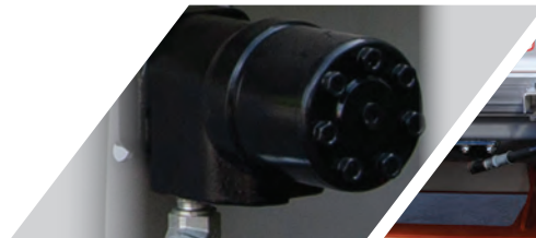
Direct Drive motor drives 6" auger