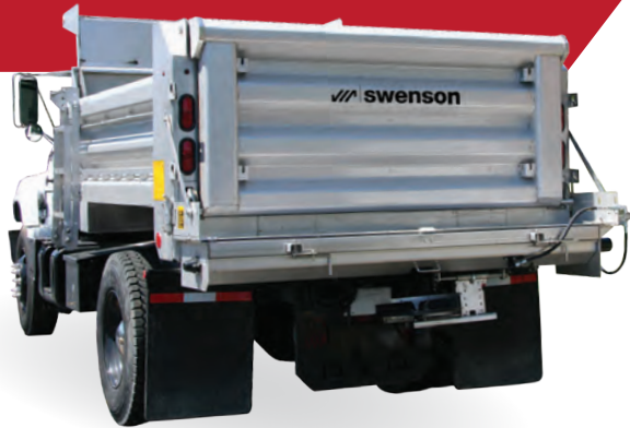
Under Tailgate S-Series