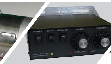
Variable speed controller allows independent control of auger and spinner