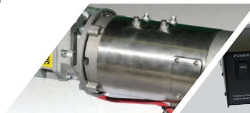
1/2 HP stainless steel electric auger motor