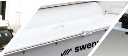
Hinged top cover lays flat to allow for normal operations when not in use