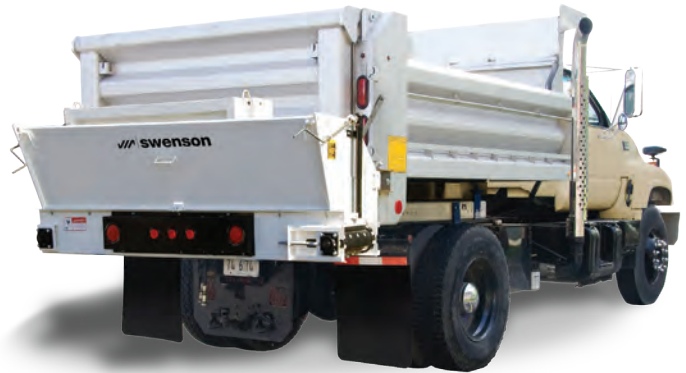
Specialty Cross Conveyor (STCC™)

Swenson tailgate spreaders are uniquely designed and engineered to work seamlessly with all standard dump body tailgates. This family of proven products includes the Replaceable Tailgate R-Series™ , Under Tailgate S-Series , and Specialty Cross Conveyor (STCC™) . These versatile products are designed for new or retrofit applications.