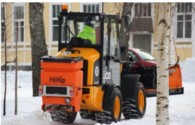
Optional color: orange