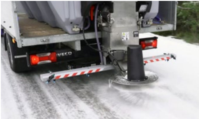
2 m wide spray bar (optional)