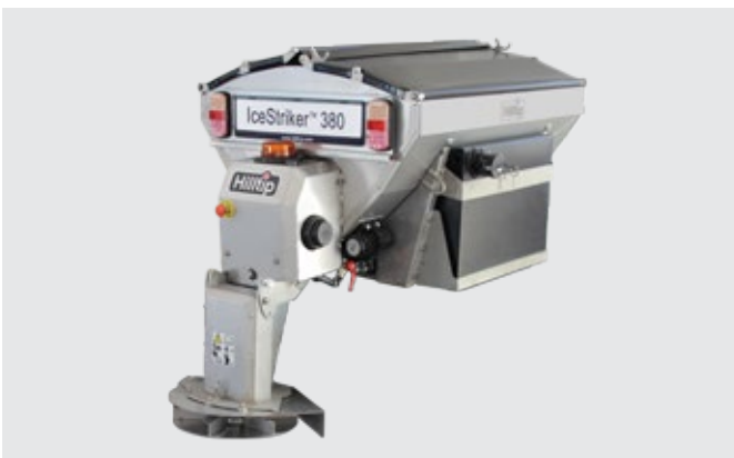
IceStriker™ 380 with pre-wet salt liquid kit, nozzles, pump with built-in tanks in the spreader construction