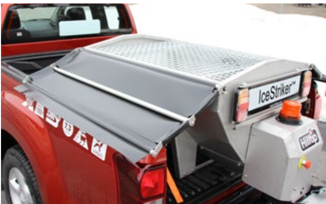
Tarp cover and top screen