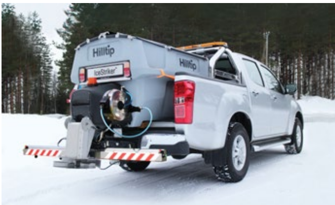
Optional spray bar and hose reel