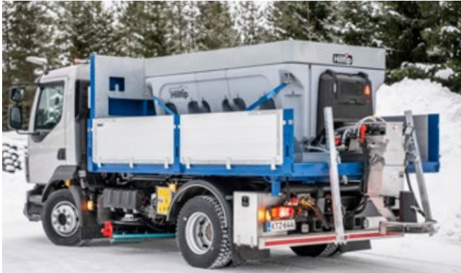
4000 AM modular spreader