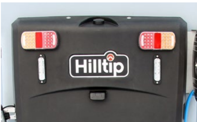
LED rear lights and strobe lights (optional)