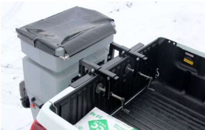
Pickup Tailgate mount