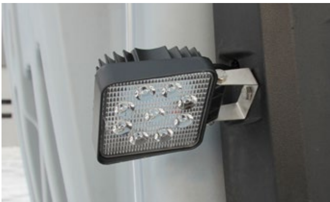
LED work light (optional)