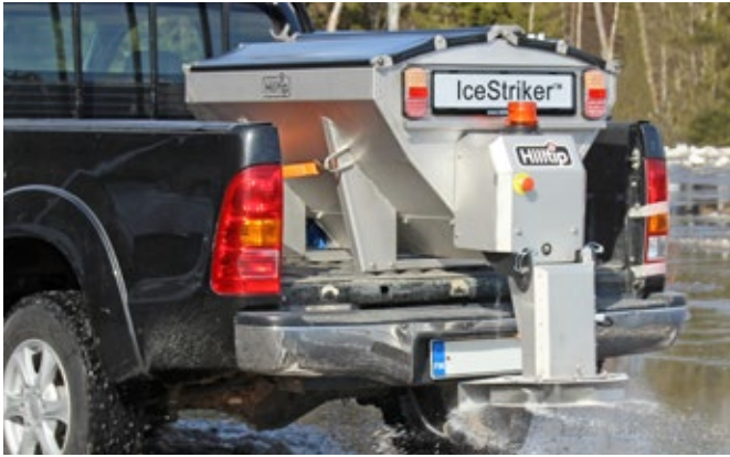
Spreading width up to 8 meter