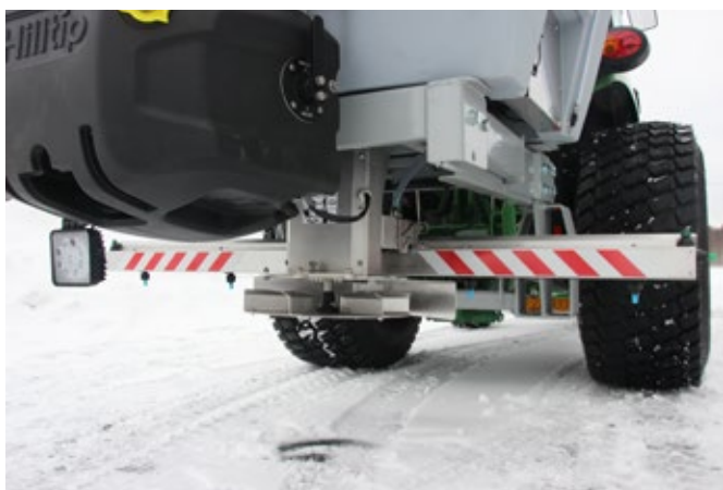
Optional spray bar