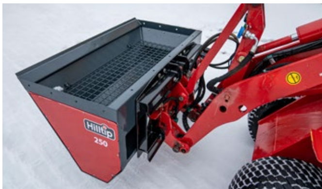
Icestriker™ 250 DSB

The IceStriker™ DSB spreader is controlled by our StrikeSmart™ Smartphone App (phone included) via a Bluetooth link with the spreader and features both GPS speed control and our HTrack™ 2-way GPRS tracking/control system as a standard feature.