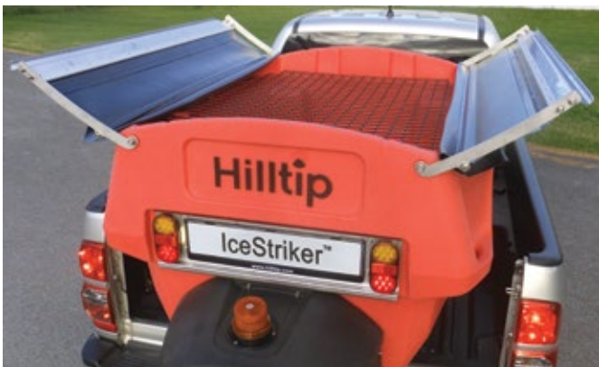
Two-piece tarp mechanism and top screen