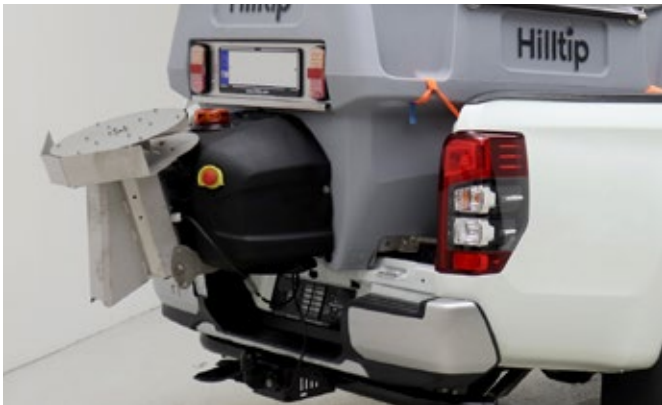
Stainless steel flip-up chute, designed for spreading salt with high humidity