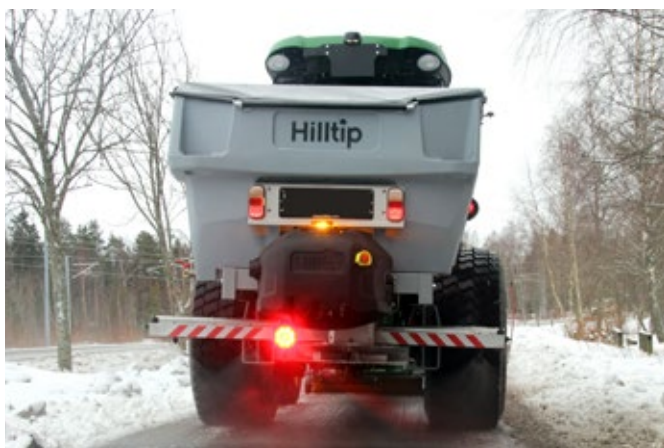
Led work light (red) and beacon light (orange)