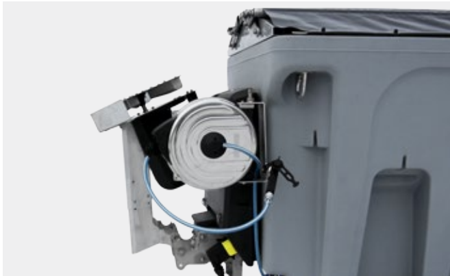
Stainless steel flip-up chute