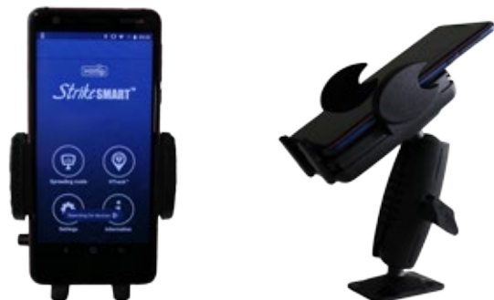
Smartphone controller holder