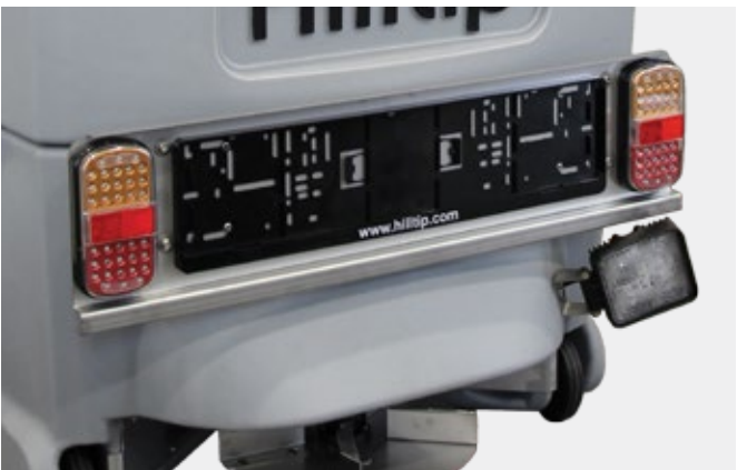
LED rear lights, license plate kit and LED work light