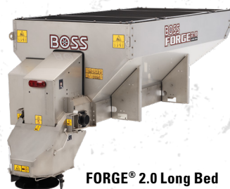
FORGE® 2.0 Long Bed 2 cubic yards of capacity Longer hopper makes loading simpler with loader bucket.