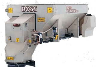
FORGE® 1.5 1.5 cubic yards of capacity (shown with pre-wet)