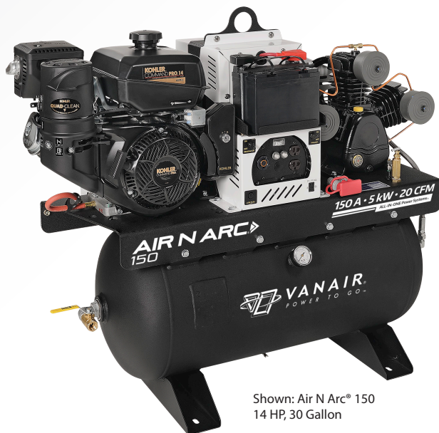
Shown: Air N Arc® 150 14 HP, 30 Gallon