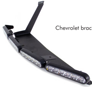
Chevrolet bracket shown. Sold in pairs.

Lights and replacement modules sold separately.