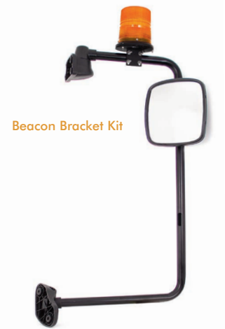
Beacon Bracket Kit