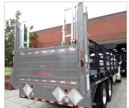
WDVBG Series Gate in stowed position