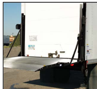
Above-floor, bed height view

Easier handling of wheeled carts, bins, and racks with this level-ride liftgate.