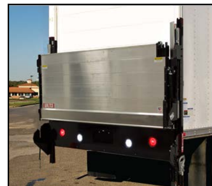
Gate shown in stowed position