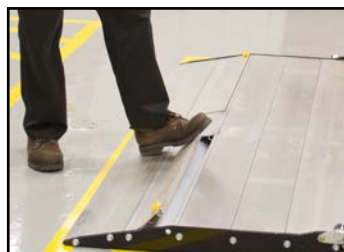
Split foot/pressure-activated cart stops