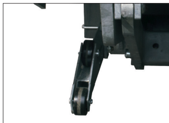
Bolt-on Parting Bar shown above.

ORDER YOUR LIFTGATE TODAY, AND WE'LL SHIP IT TOMORROW.