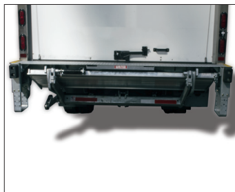
EM Series Gate in stowed position.