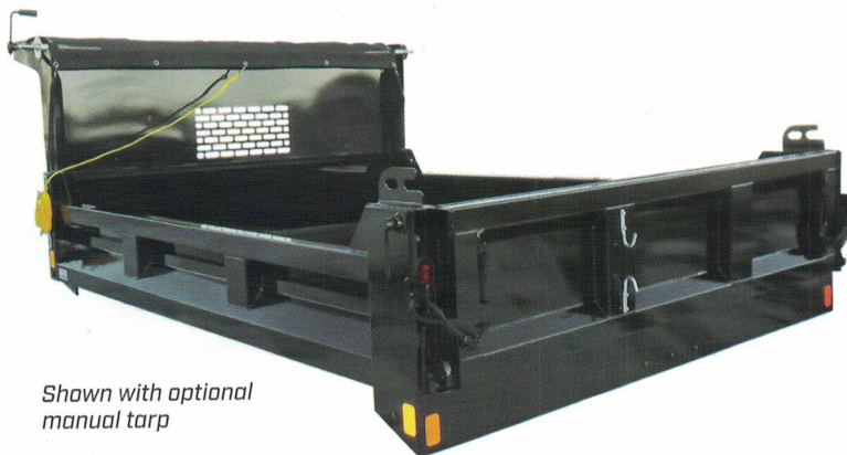
Shown with optional manual tarp