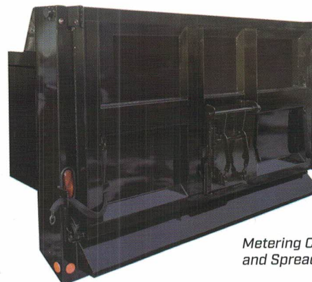
Metering Chute and Spreader Apron