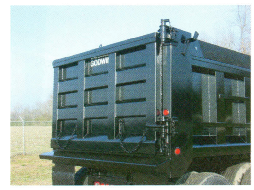
Optional air barn door with asphalt lip shown.

Godwin Manufacturing Company, Inc. Highway 421 South-P.O. Box 1147-Dunn, North Carolina 28335 (910) 892-0141 Fax (910) 892-7402