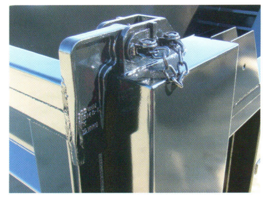
Tailgate hardware is cast steel with grease fittings.

Air tailgate latch, 36" cab shield, 8 gauge sides, 1/4" floor, sloping tailgate, air latch barn door tailgate.