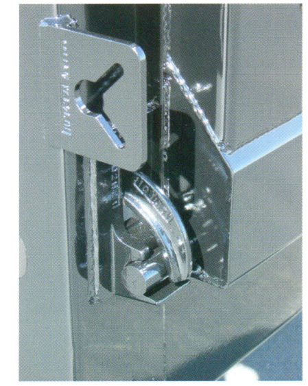
Lower tailgate latch is 4140 grade cast steel. Latch pivots are bushing type width 1 1/4" diameter pin for extra support.