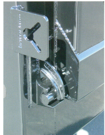
Lower tailgate latch is 4140 grade cast steel. Latch pivots are bushing type width 1 1/4" diameter pin for extra support.