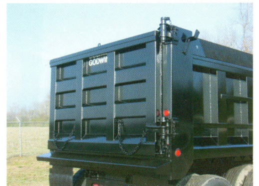
Optional air barn door with asphalt lip shown.