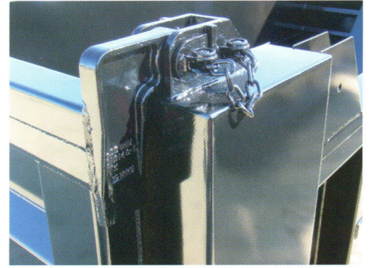
Tailgate hardware is cast steel with grease fittings.

Air tailgate latch, 36" cab shield, 8 gauge sides, 1/4" floor, sloping tailgate, air latch barn door tailgate.