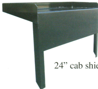
24" cab shield

All Godwin bodies are constructed of 10 gauge ASTM-A 572 grade 50 material or equal to ensure durability and long life. To help our bodies maintain their durability and life they are also powder coat primed black standard. A 24" cab shield is standard equipment on the 400T and 500TR.