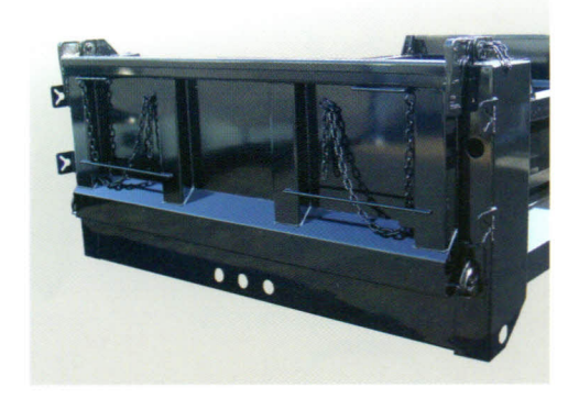
Full width rear apron for added strength. Full depth rear corner post and forged lower latches.