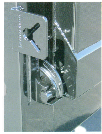
Lower tailgate latch is 4140 grade cast steel. Latch pivots are bushing type width 1 1/4" diameter pin for extra support.