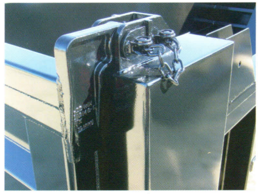
Tailgate hardware is cast steel with grease fittings.

Air tailgate latch, 36" cab shield, 8 gauge sides, 3/16" one piece floor, 6 panel tailgate, Center coal door, Grip strut walkrod, Horizontal bracing, Asphalt chute, Front corner posts