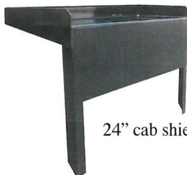
24" cab shield

All Godwin bodies are constructed of 10 gauge ASTM-A 607 grade 50 material or equal. To help our bodies maintain their durability and long life, black powder coating over a zinc powder coat primer is standard equipment. A 24" cab shield is also standard equipment on the 184U.