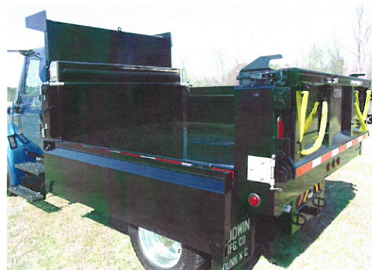
Optional drop sides in the down position. The side easily unlatches with a single handle and folds down lower than the body floor. Body shown with additional options.