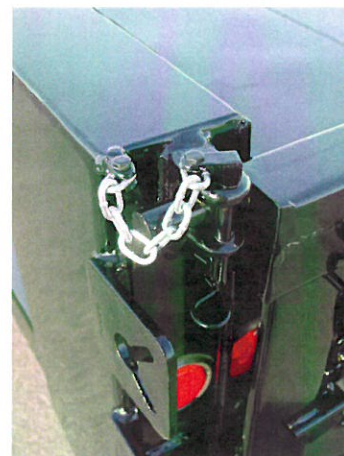
Double acting tailgate with drop pin upper hardware

36" cab shield, 8 gauge sides, 3/16" one piece floor, fold down 13" sides, 18" sides, Zinc powder primer, quick release upper hardware.