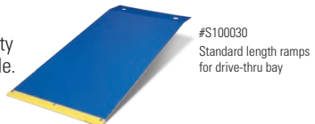
#S100030 Standard length ramps for drive-thru bay