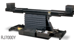
#RJ7000Y 7,000 lbs. capacity 4,500 lbs. capacity also available

Increase your service opportunities by lifting front, rear or all wheels off the runways for brake, tire, suspension and two or four-wheel alignment work.