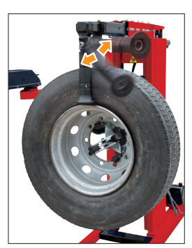
STANDARD ROLLER Easy setting for tubeless tires