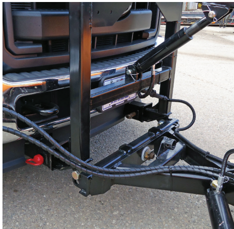
Standard Medium-duty Quick Hitch: for use with MTP & MTP-Flex.

Quick connect and disconnect design. Level-lift feature built-in. Select a hitch mounting kit to match your truck's make and model. Optional tilting hitch is also available.