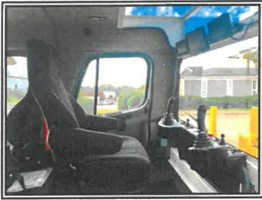
Air/Electric-Over-Hydraulic Joystick Controls-Operator Seat in Work Position