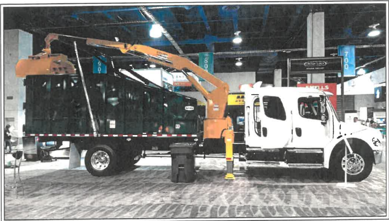
*Shown with optional equipment