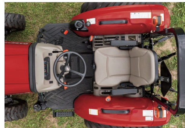
The large operator area with deluxe features on Farmall compact C cab and non-cab tractors provides outstanding operator comfort along with greater ease of operation. (Gear transmission layout shown here.)